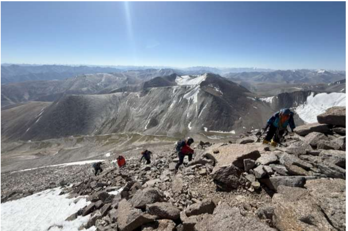
NEGOTIATING BOULDER AREA TOWARDS SUMMIT ON 06 JULY 2025 AT 0750 HRS