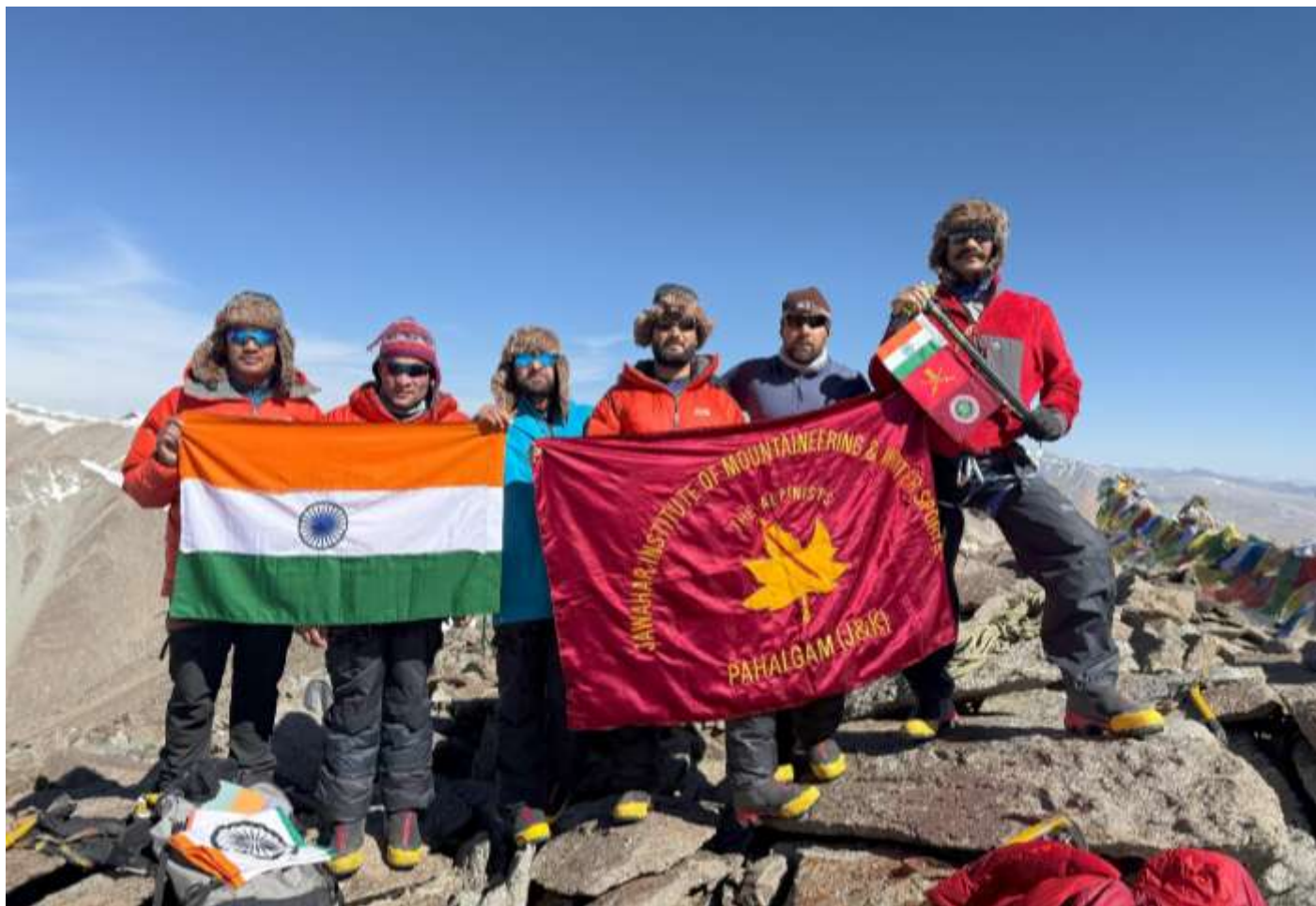
TEAM ON THE SUMMIT OF MT UT KANGRI - II 6049 MTR AT 0810 HRS ON 06 JULY 2025 GRID REFERENCE N 33°30'44" E 77°41'60") RECORDED IN GPS