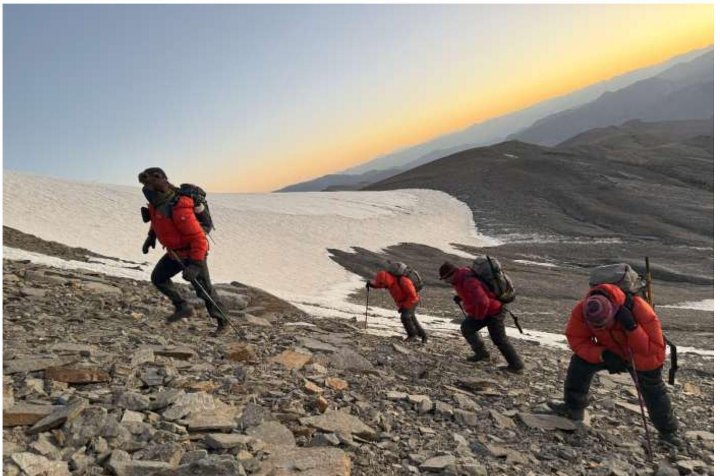
NEAR GLACIER AT FIRST LIGHT OF 06 JULY 2025 AT 0500 HRS