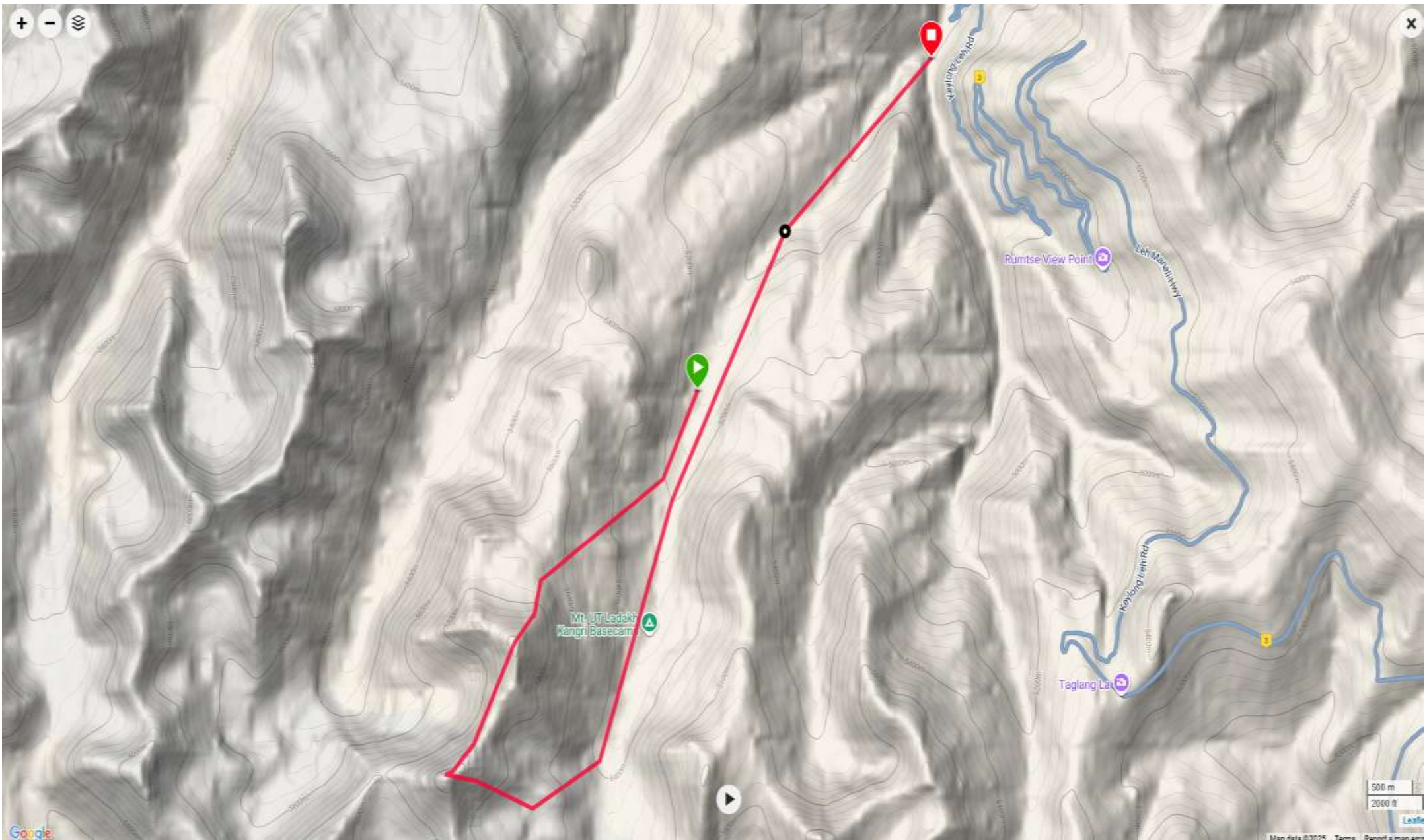
GPS TRACKING IN TEAM LEADERS WATCH ON 06 JULY 2025