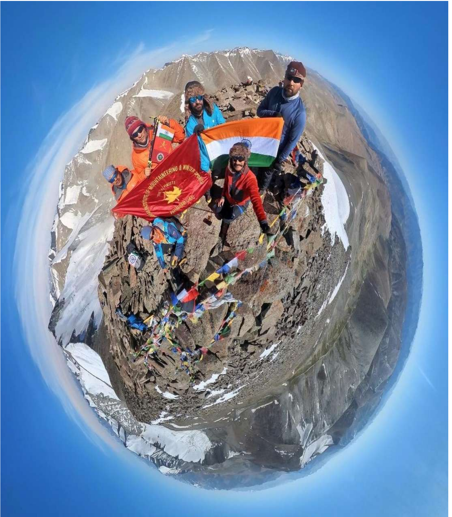
PANORAMA VIEW OF UT KANGRI - II AT 0810 HRS ON 06 JULY 2025 BY INSTA 360