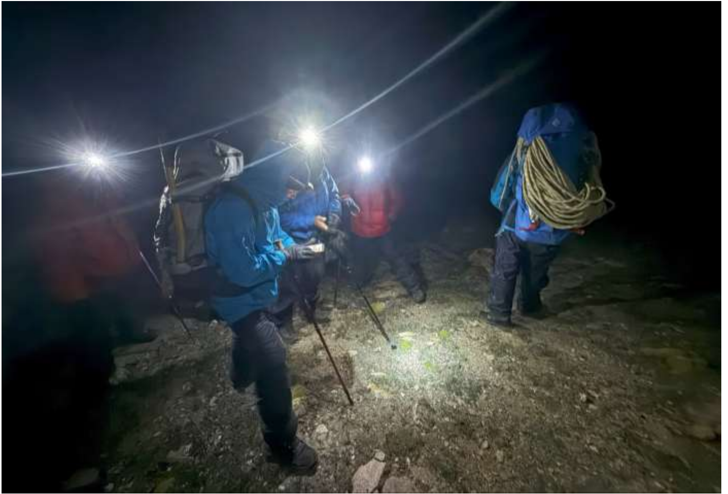
TEAM STARTED FROM ROAD HEAD CAMP ON 05 JULY 2025 AT 2300 HRS ON 05 JULY 2025