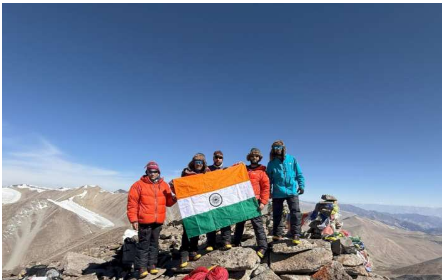
HOISTED BHARTIYA TIRANGA ON THE SUMMIT OF MT UT KANGRI - II 6049 MTR AT 0810 HRS ON 06 JULY 2025