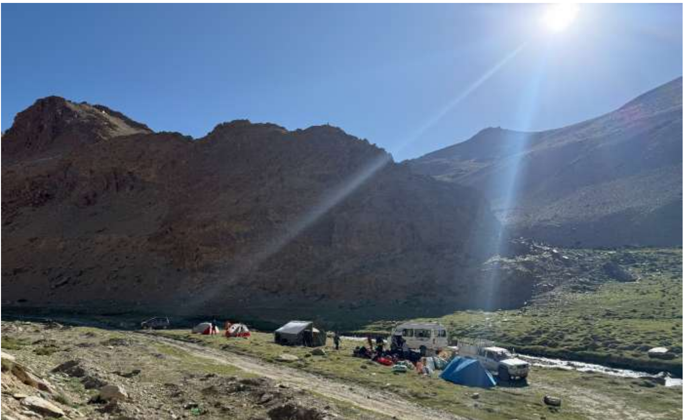
ESTABLISHED MT UT KANGRI ROAD HEAD CAMP ON 05 JULY 2025 AT 1700 HRS