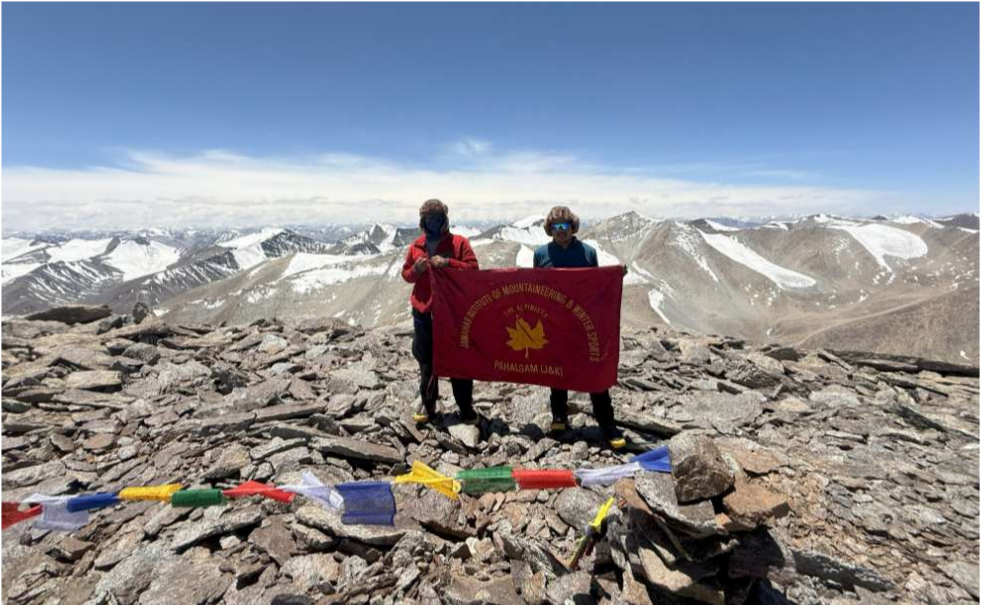
TEAM ON THE SUMMIT OF MT UT KANGRI - I 6102 MTR AT 1140 HRS ON 06 JULY 2025 GRID REFERENCE N 33°30.0926' E 077°41.5211' RECORDED IN GPS