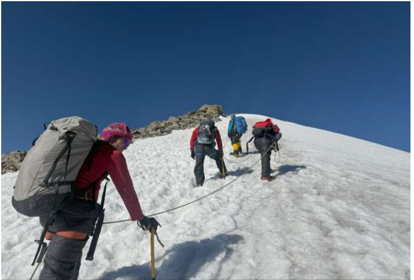
NEGOTIATING STEEP WALL TOWARDS SUMMIT ON 06 JULY 2025 AT 0735 HRS